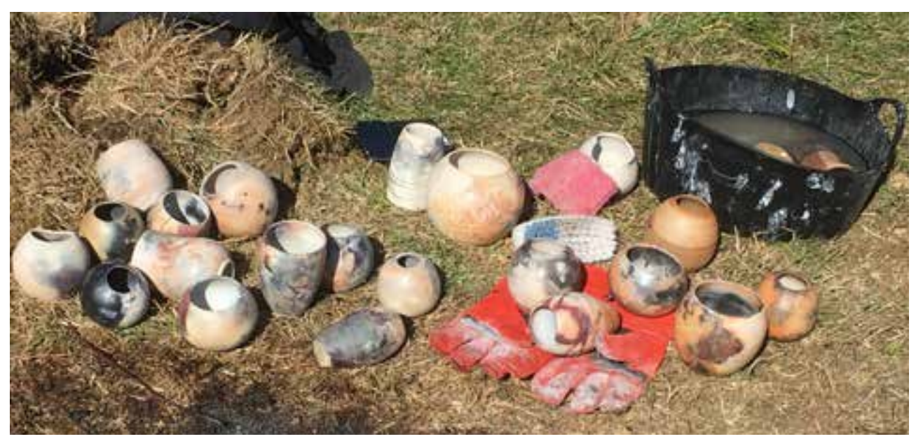
Helen's pots after washing