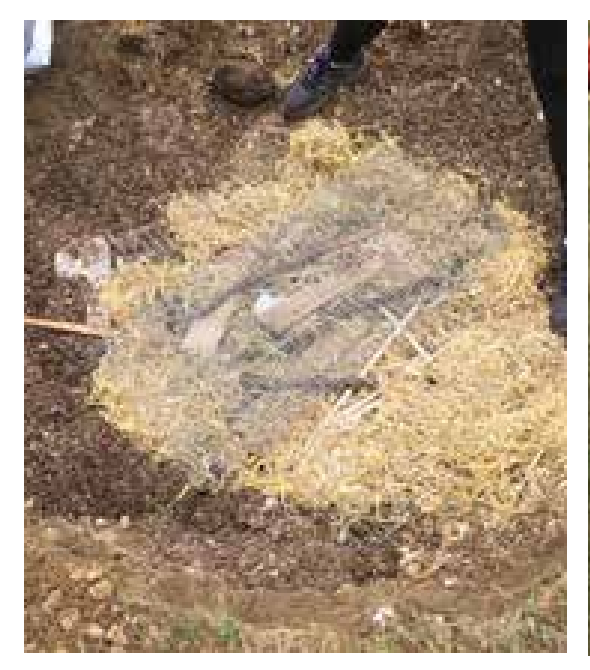
Fuel wood below the steel mesh grid