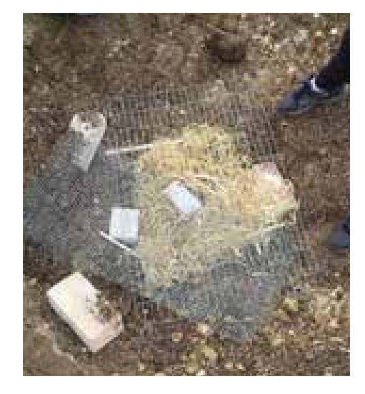
Fire bricks keep the mesh above the pit base