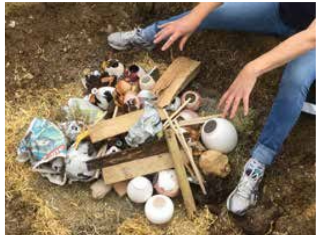
Some pots are naked, some wrapped in paper and some in foil saggars interspersed with organic materials, crumpled paper, kindling and fuel wood