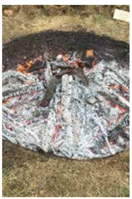
Last wood added, 1 hr 5m after ignition - more wood was added wherever we could see pots poking through the ash, trying to keep them covered