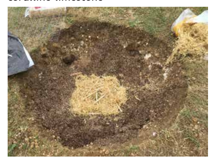
Wood shavings and a few charcoal briquettes at the bottom