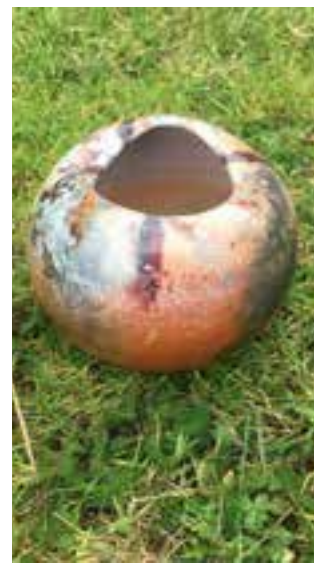
Earthenware with white stoneware terra sigillata spray around the top. The blue areas to the left are slightly corroded and therefore due to the action of sea salt. The effect of banana skin is clearly shown.