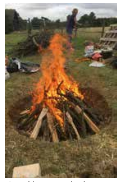
Geoff Jones helping at fire ignition